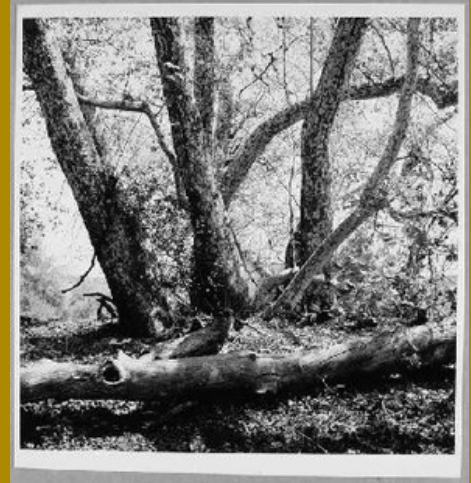
William R. Current

The proposed project involves removing the concrete channel and adjacent trees and landscaping for the entire length of the Laguna Canyon Frontage Road, in the area from the Hive Center to the Mobile Home Park at Woodland Drive. This includes Seven Degrees, the Sawdust Festival, and the Boys/Girls Club frontages. The concrete channel will be replaced, but almost all of the large existing trees [5 pines and 2 sycamores] were originally planned for removal without replacement. The pine trees are over 60 years old.